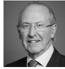
LORD RICHARD BEST OBE DL Member of the House of Lords