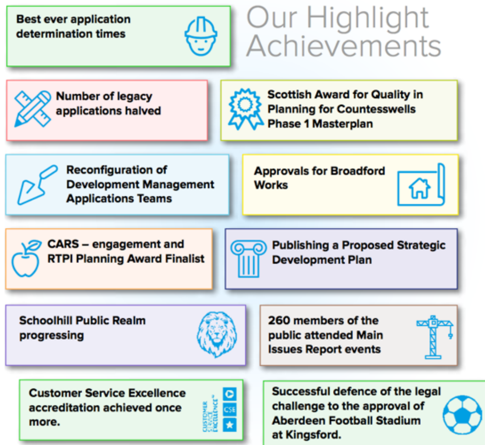
Figure 3 Aberdeen City Council PPF 2017 Highlighted Achievements