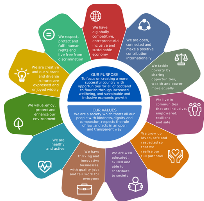
Figure 1 Scotland's National Performance Framework Outcomes, aligned with the UN SDGs

The alignment shown below is about both direct and indirect contribution.