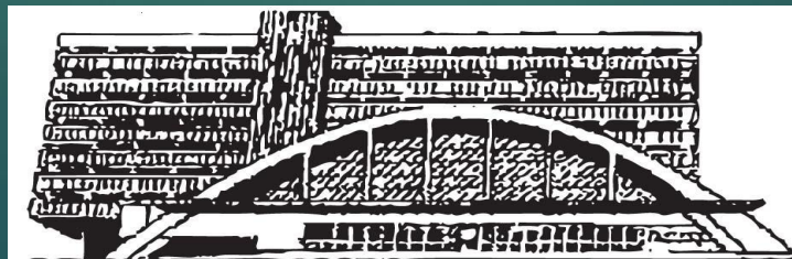
BRISTOL LINK WITH BEIRA