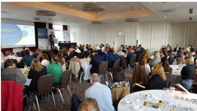
Northern Ireland Planning Conference 2017