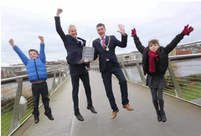
Celebrating Northern Ireland's Best Place