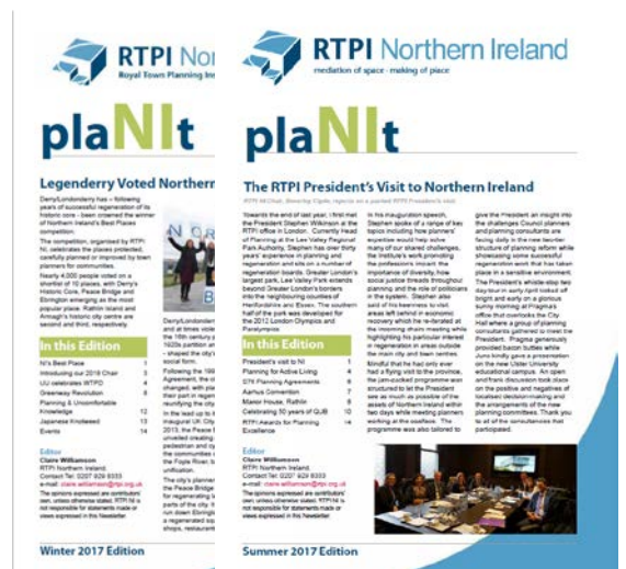
Two editions of PlaNIIt published