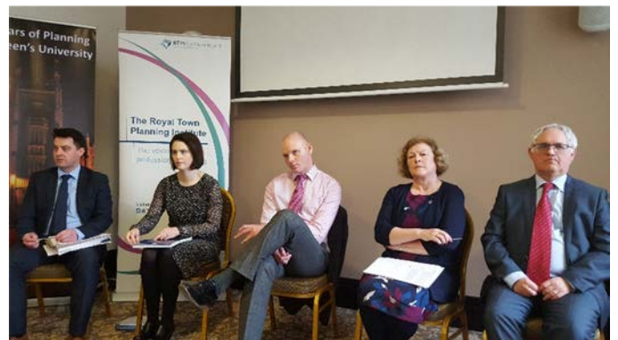
Speaker Panel at the SPPS event at Crumlin Road Gaol