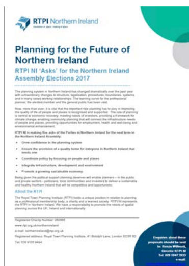
RTPI NI Election Asks 2017