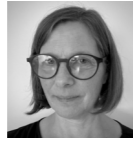
FIONA SIMPSON MRTPI Scottish Government Chief Planner