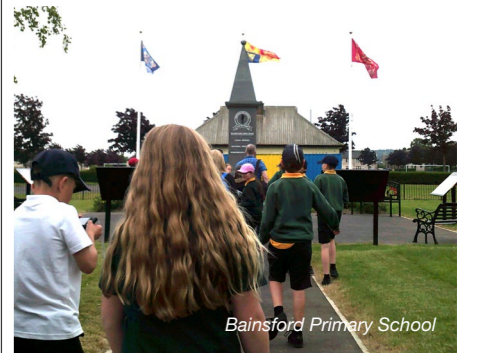
Bainsford Primary School

explained what mattered to them most. This created a route to trustful dialogue across generations. Additionally, professionals and wider community stakeholders met each other and could discuss alignment in their work for achieving the needs of people in a specific place.