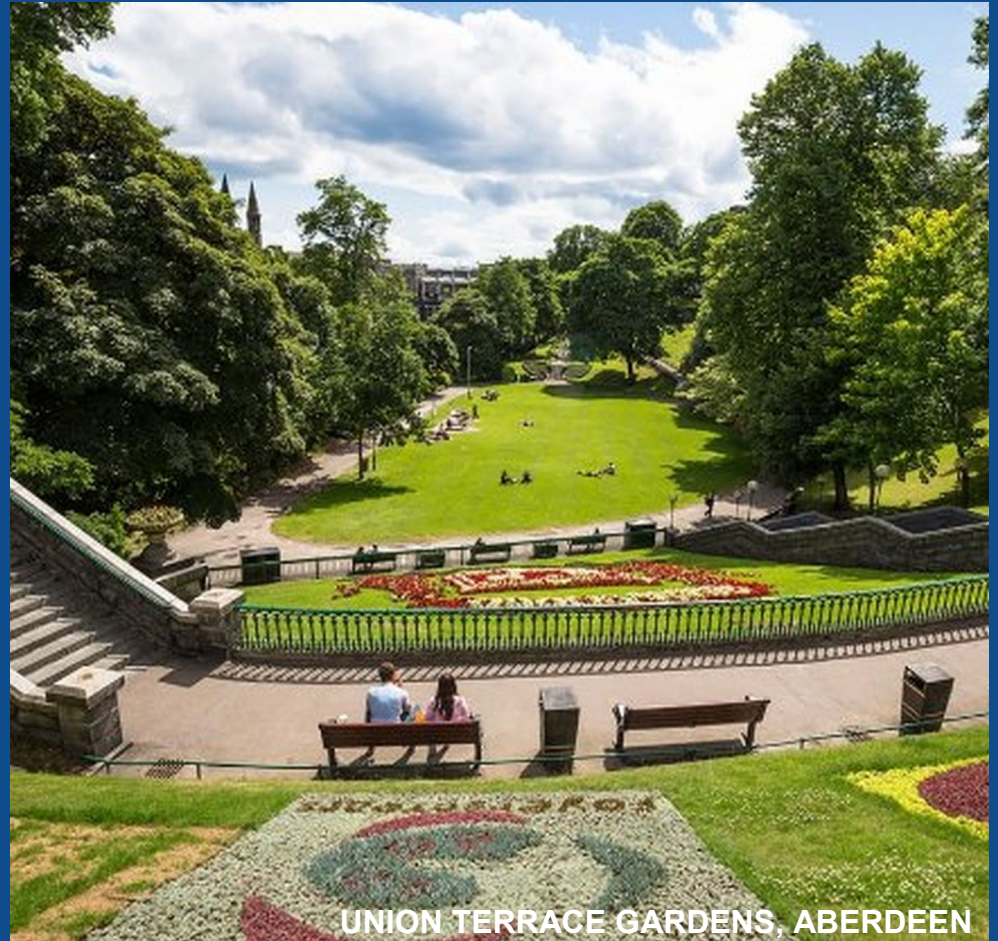
UNION TERRACE GARDENS, ABERDEEN