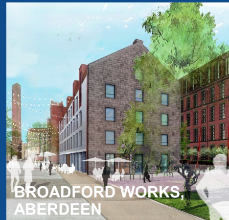
BROADFORD WORKS, ABERDEEN