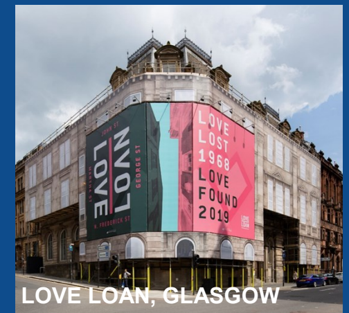
LOVE LOAN, GLASGOW