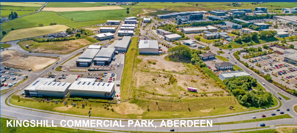
KINGSHILL COMMERCIAL PARK, ABERDEEN