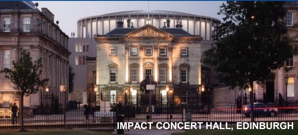
IMPACT CONCERT HALL, EDINBURGH