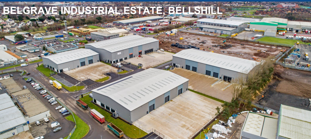
BELGRAVE INDUSTRIAL ESTATE, BELLSHILL