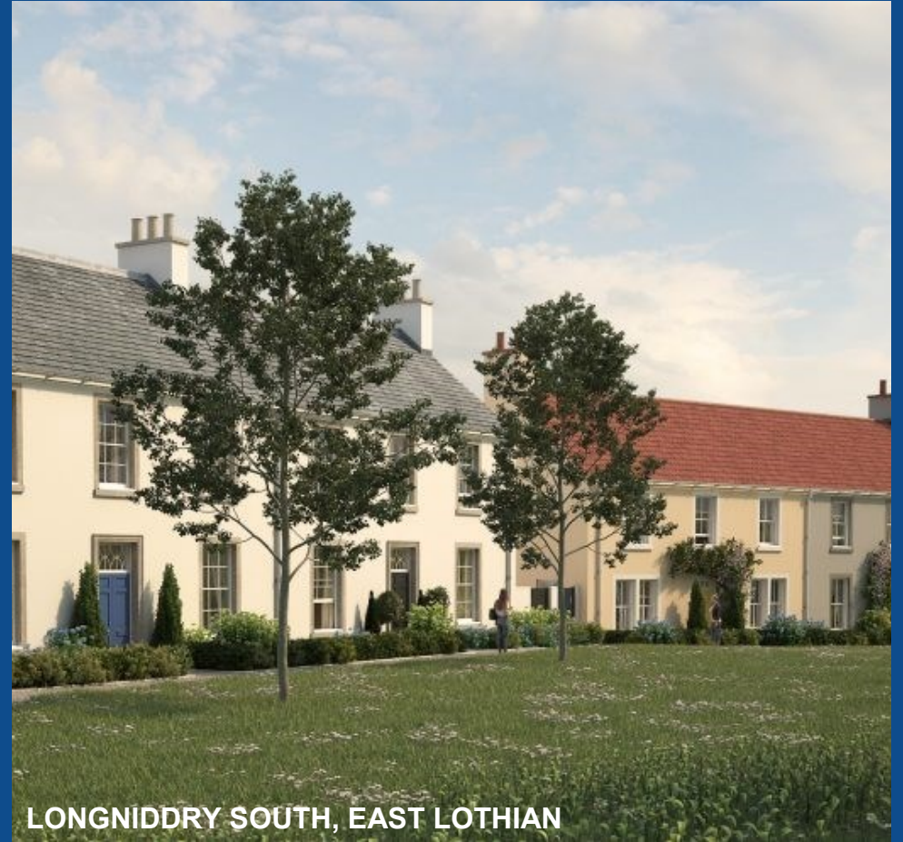
LONGNIDDRY SOUTH, EAST LOTHIAN