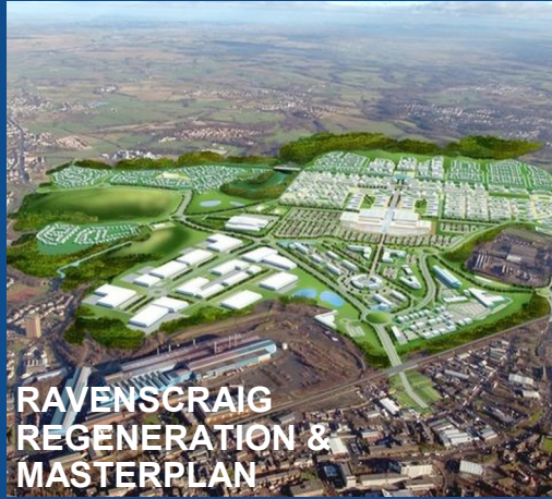
RAVENS CRAIG REGENERATION & MASTERPLAN