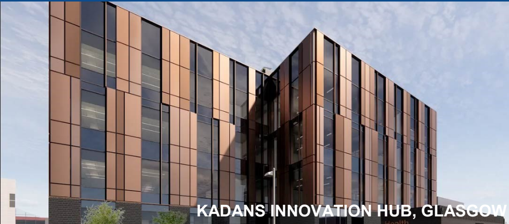
KADANS INNOVATION HUB, GLASGOW