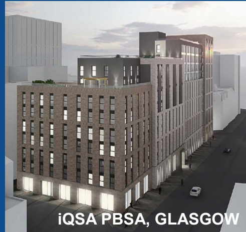
IQSA PBSA, GLASGOW