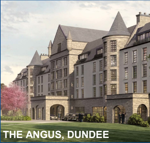
THE ANGUS, DUNDEE