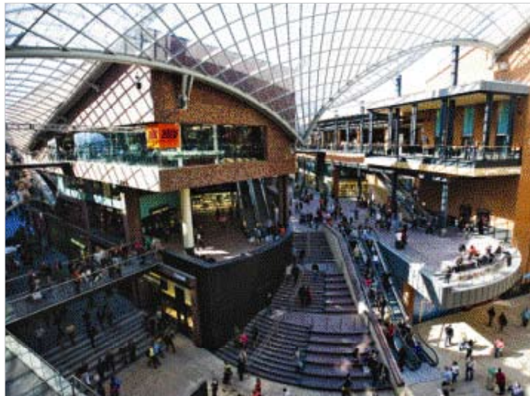
Bristol: action being taken to ease development permission conditions

Actions include a review of the uses granted as part of mixed-use scheme planning permissions, reconsidering the overall package