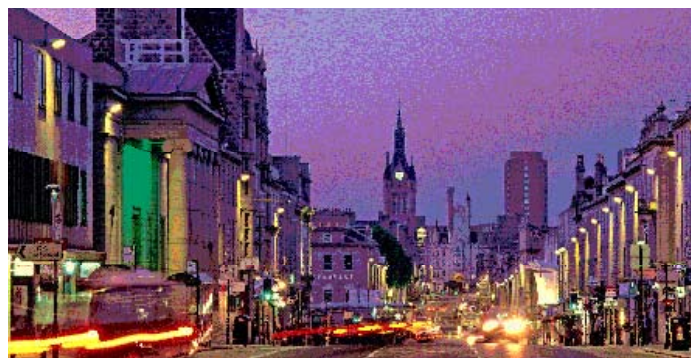
Aberdeen: spatial planning to be explored by universities' forum

12–13 June. Irish–Scottish Forum for Spatial Planning. Aberdeen. The goal of this first meeting of the forum comprising the University of Aberdeen, Queen's University Belfast and the National University of Ireland, Maynooth, is to place formal planning and spatial imagining of cities, towns and countryside in a historical, environmental and cultural perspective and relate this to concepts of nation and identity. Cost: Free. For more information, please email riiss@abdn.ac.uk