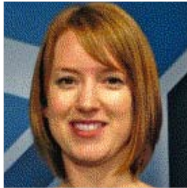
Guest: celebrating the profession

But do not simply ask what benefits the Planning Convention can offer you. The bigger question is perhaps how you can contribute to it. To carry out planning in a changing climate and economically uncertain times needs a commitment to