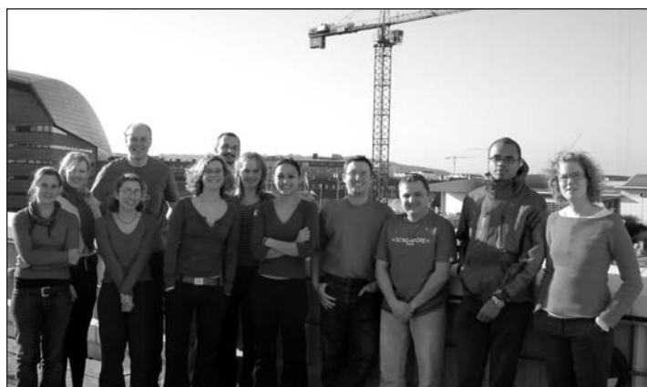
Staff from the Cardiff office of Arup supporting the RedR charity.

On RedR day Arup staff are encouraged to wear red and give a donation to the charity. Each year over 50 Arup offices world wide take part in helping to raise the profile of RedR and to raise in the region of £6000 between them. In five years Arup staff have raised over £20 000. As well as wearing red, fundraising activities take place and this year the Cardiff office staff wore red, coordinated a raffle and a cake sale. The office staff also hosted a presentation by linking into a talk by a