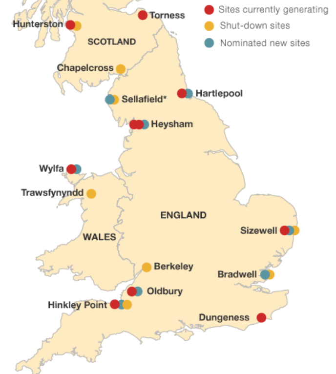
Nominated sites for new nuclear power stations, Oct 2010