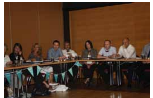
Above: Project Argus Training, Cardiff Right: Eisteddfod Seminar 2012, Wrexham

To support the National Eisteddfod this year in Wrexham, we held a seminar to discuss Planning and the Welsh Language. There were an excellent line up of speakers discussing the policy context, past experiences of applying the policy, a legal perspective, current practice in developing local policies and developing Language Impact Assessments. This event also led delegates to support RTPI Cymru with the Welsh Language Board to raise the problem of the draft TAN 20, issued for consultation early in 2011, with relevant Ministers.