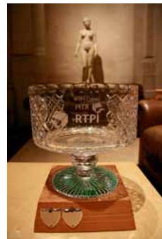
Above: The coveted Wales Planning Award Rosebowl

The Planning Officers Society for Wales (POSW) provides an excellent conduit to communicating with the Local Authority Planners and Members across Wales. RTPI Cymru works in partnership with POSW on initiatives, including joint CPD events.