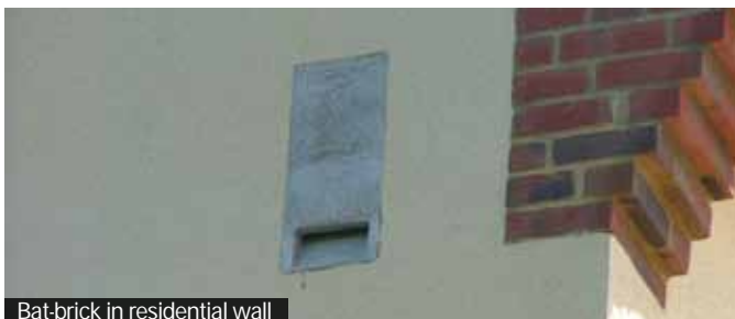
Bat-brick in residential wall

All UK bat species are afforded the highest protection, and considering that injuring or deliberately disturbing a single bat can attract a £5,000 fine or six months in prison, it pays developers and their teams to be well-informed. We use a number of methods to assess a site for bat activity. Daytime inspections give an idea of the general potential resource for bats; dawn and dusk surveys are used to estimate the amount of bat activity on a site, by monitoring emergence and re-entry, especially once bat roosts have been located. Climb-and-inspect surveys are most reliable when activity surveys have indicated a roost in a tree is likely. Our bat specialists are qualified to cover all methods of inspection and can advise on the best timing to mitigate for a roost.