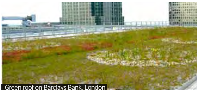
Green roof on Barclays Bank, London

Green roofs not only have substantial biodiversity value in the urban context, but have important benefits in ameliorating storm water and for mitigating local temperatures. Extensive green roof designs with deep substrate of fine aggregate effectively replicate some brownfield conditions and have been shown to support rare invertebrates. On-going research will help us further understand the design requirements for green roofs and invertebrate diversity, as well as the knock-on benefits to bats and birds.