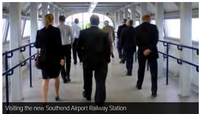
Visiting the new Southend Airport Railway Station