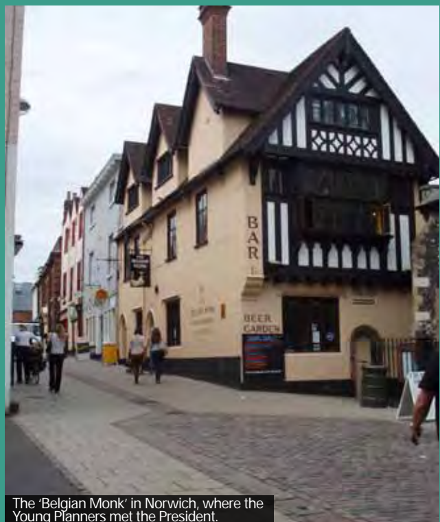
The 'Belgian Monk' in Norwich, where the Young Planners met the President.