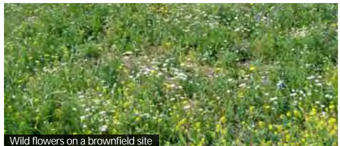
Wild flowers on a brownfield site

This can be a difficult area with contradictions: many UK BAP invertebrates are afforded this status in response to recent declines and yet can actually be widespread in distribution. Some brownfield sites are of exceptional importance and support good populations of many species that have otherwise been lost from the wider countryside.