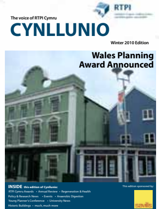
Cynllunio, Winter 2010

With all of this change taking place, this year's Wales Planning Conference is themed: New Beginnings? What will the outcome of the Referendum mean for Wales, or will it be business as usual; who will be the Minister responsible for planning in Wales, with the current Minister, Jane Davidson standing down? We all face difficult resource constraints, what does this mean for how Local Planning Authorities need to work?