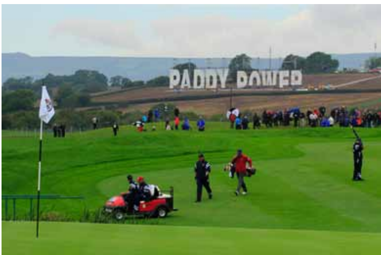
Above: The Paddy Power sign under construction

Needless to say the application was very hotly contested by