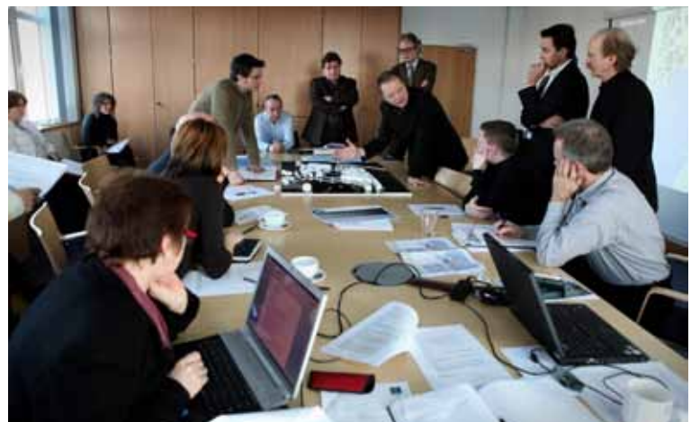
Above: DCfW's Design Review in action