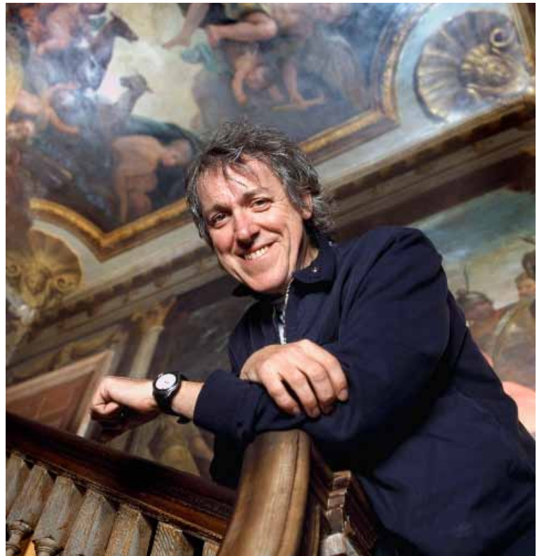
Above: Griff Rhys Jones

"I firmly believe that human ingenuity is the answer to the problems we face with sustainability. This Research Institute is offering to bring together different disciplines and to look at sustainability across the globe in different localities so that we can start to measure and assess