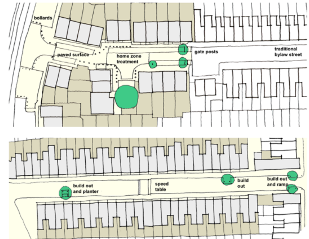
Above: Map showing the different forms of the two streets. Street One is below and Street Two is above

Street One had 100 adults passing through on foot, often to addresses in the street. Eight children were seen in the street. Six passed through with adults and two came out with adults to buy an ice cream. Six teenagers passed through, with three of them walking straight down the middle of the road. This was the only time the pavements weren't used. No elderly people were