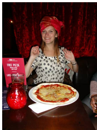
A picture of a team member in a hat