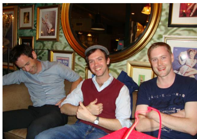
Drinks and friendly banter