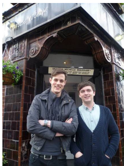
The Crown and Anchor