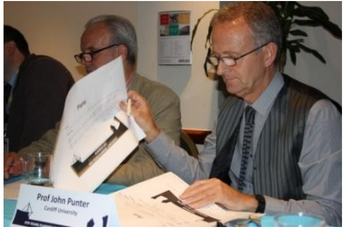
Judging the Planners Den

Further information including all the presentations from the 2010 conference have been uploaded onto the Young Planners pages of the RTPI website.