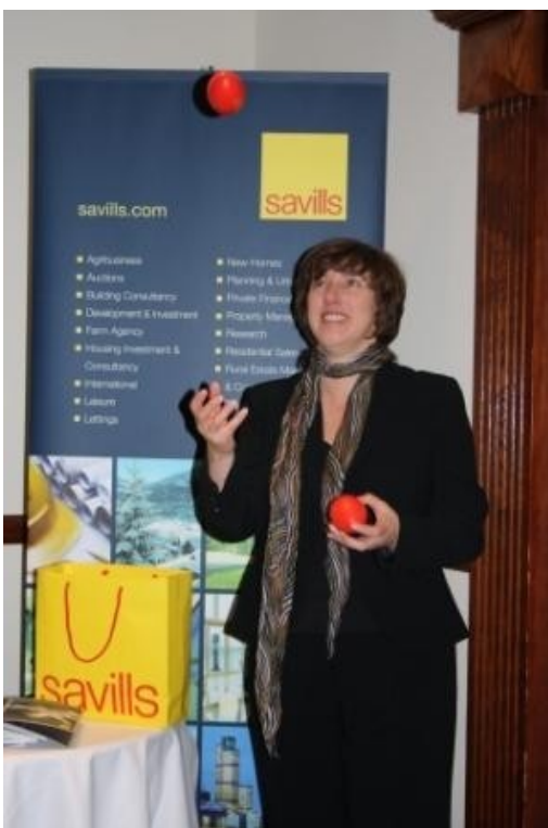
The President takes a break