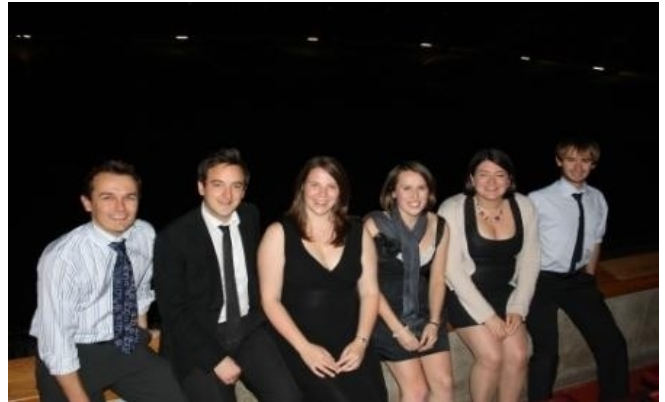
The Conference Organisers

She described the RTPI's discreet lobbying of ministers and its alliance of business, environment and development bodies which stressed to Pickles the need to address larger than- local issues within the localist reform of the planning system. In this respect, the president reiterated her priority to work with other organisations and "to get on with it and grasp the opportunity".