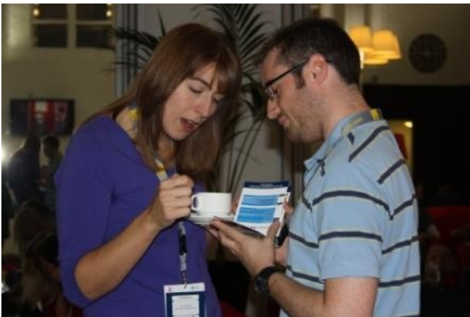
Delegates get to grips with the lanyard delegate packs

One delegate summed up the conference as providing a healthy mix between learning exercises and opportunities to meet like-minded professionals. For another, meeting other planners has "re-ignited the passion for planning".