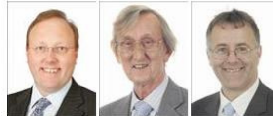
Frodsham & Helsby